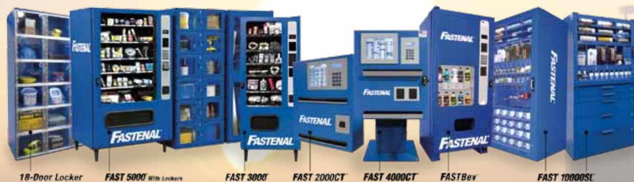
18-Door Locker FAST 5000 With Lockers FAST 3000 FAST 2000CT FAST 4000CT FAST Bev FAST 10000SL