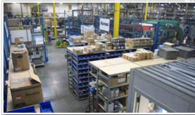
Fastenal In-Plant Store

Local Fastenal store personnel organize and bar-code your stock areas, help you establish min/max reorder triggers, and continuously monitor and replenish your stocking locations to stay within your target inventory levels. Delivered product is labeled and bar-coded for specific storage areas for optimal speed and accuracy.